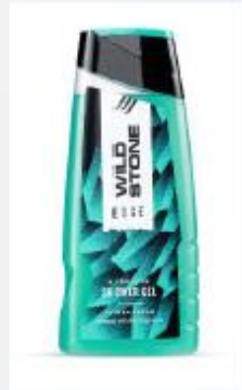
MALE GROOMING OFFER

*Offer Product: 200 ml Wild Stone Edge Shower Gel ; MRP : Rs. 299/- Assured Gift on Purchase of Male Grooming Product 100 ml Secret Temptation Hair Serum, MRP : Rs 299/- Assured Gift on Purchase of Female Grooming Product