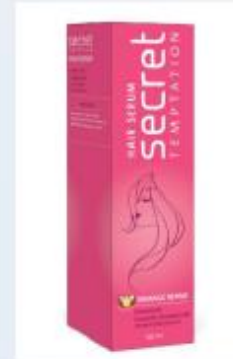
FEMALE GROOMING OFFER